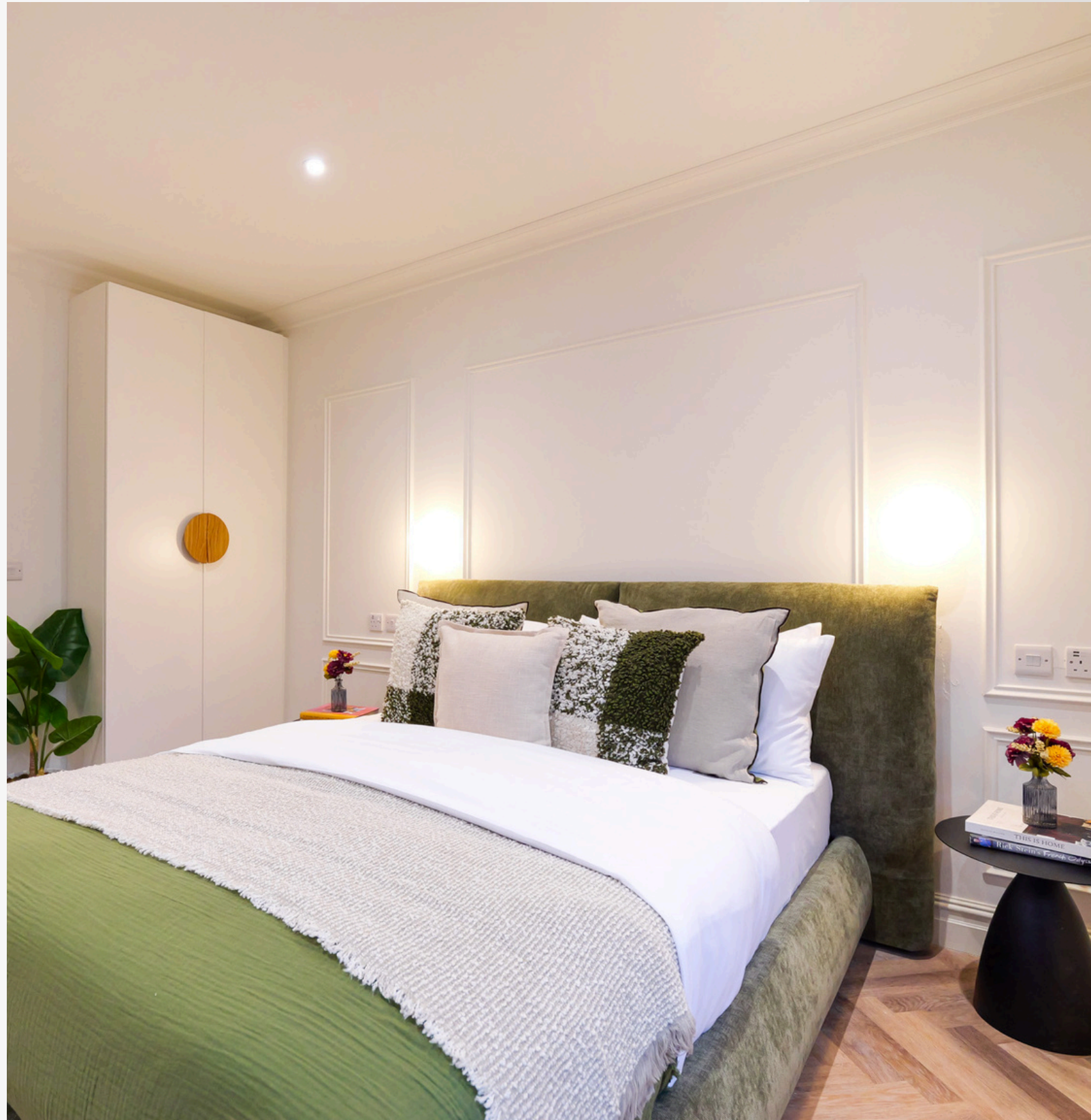
// EMBER, NORTHERN QUARTER