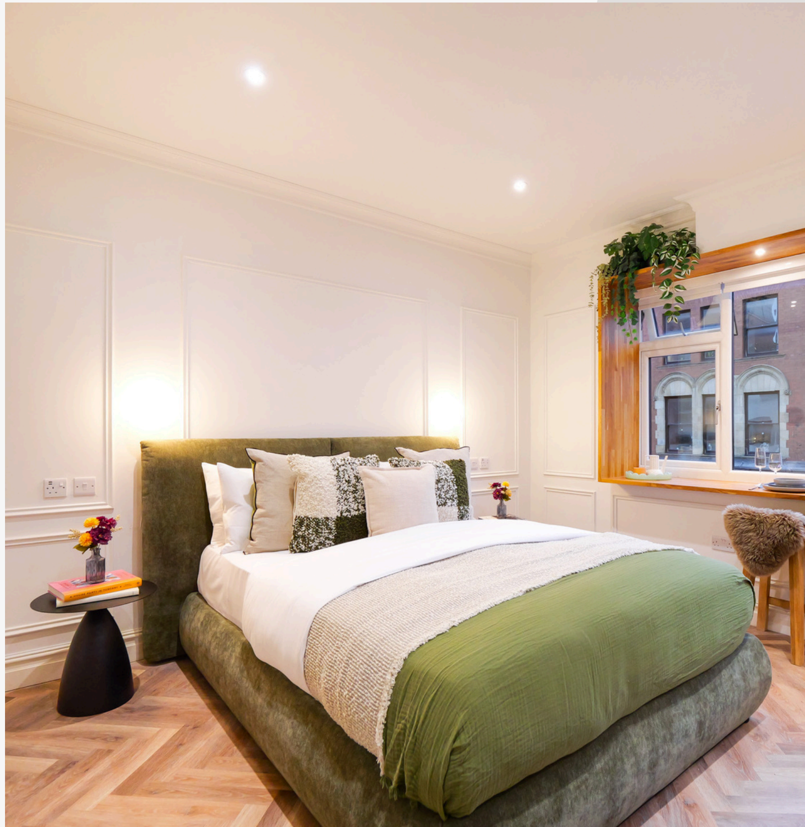
// EMBER, NORTHERN QUARTER