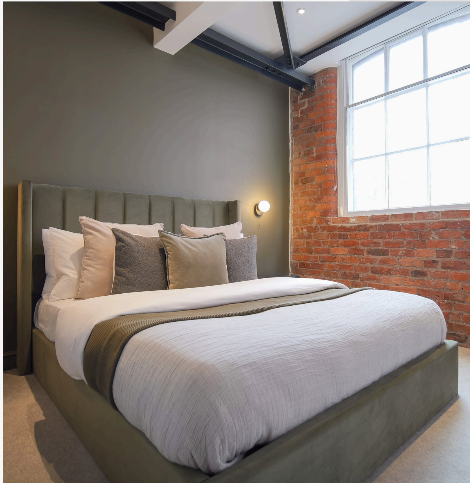
// MECHANICA, ANCOATS