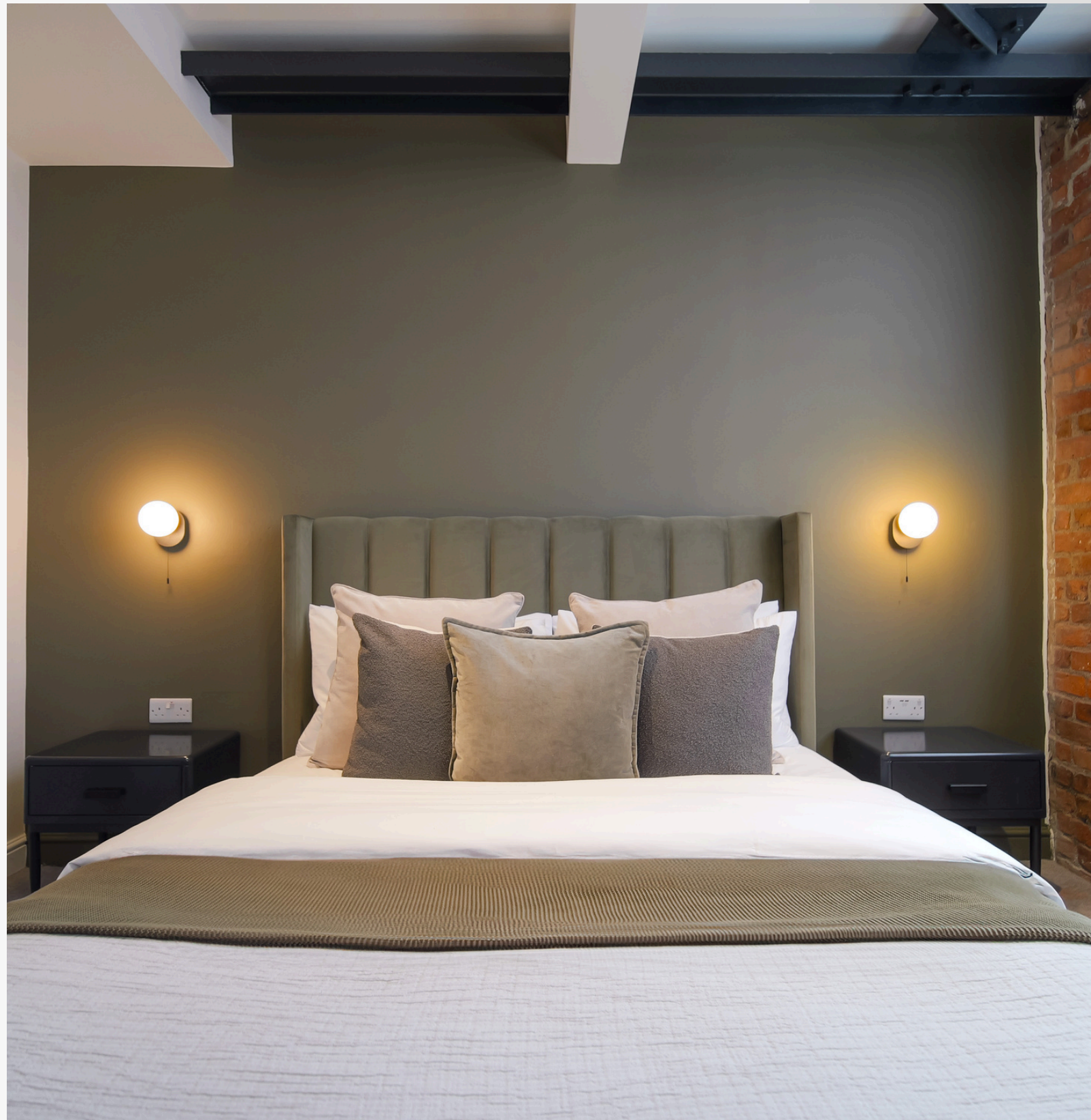
// MECHANICA, ANCOATS