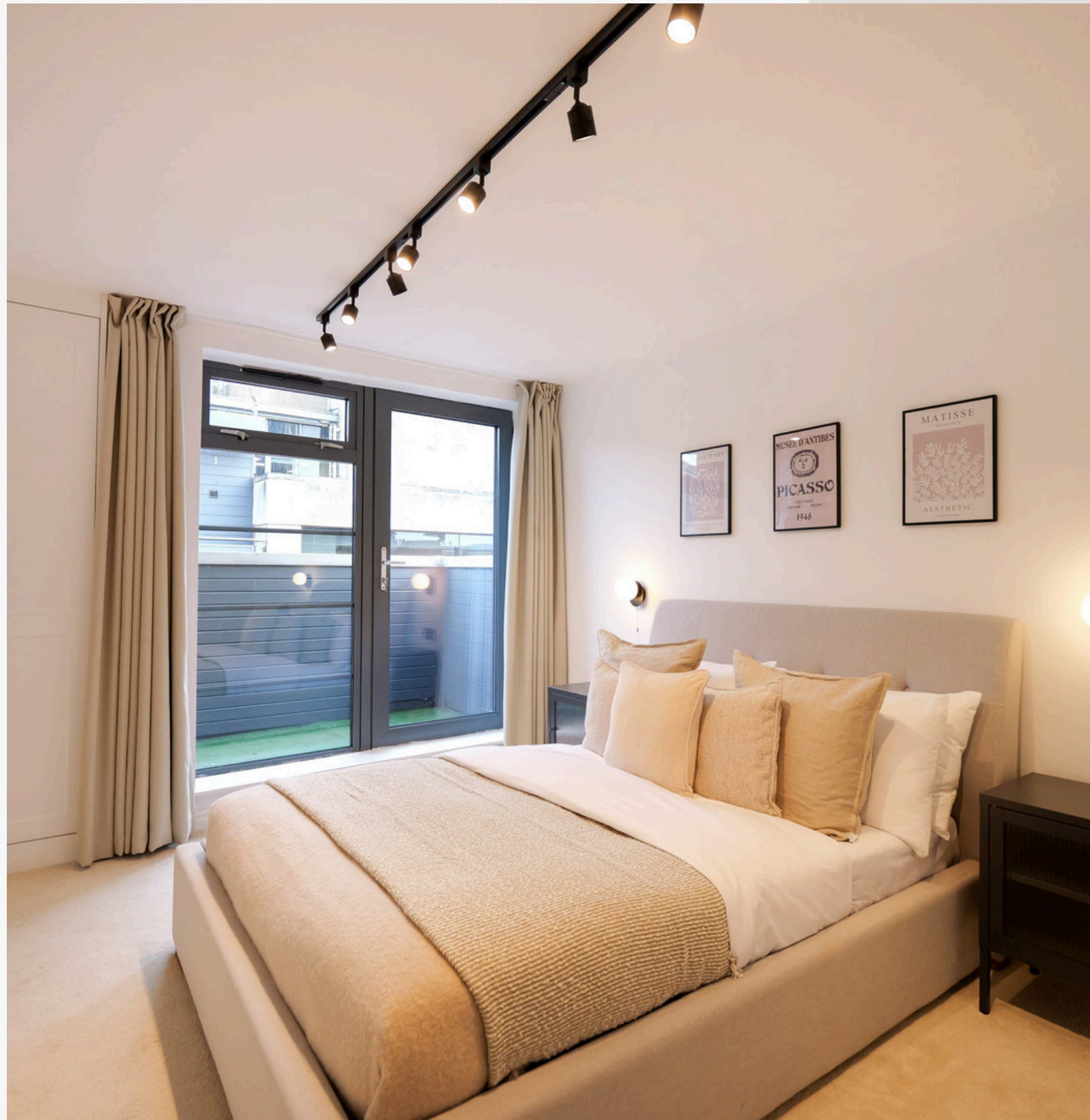
// AXIS, CASTLEFIELD