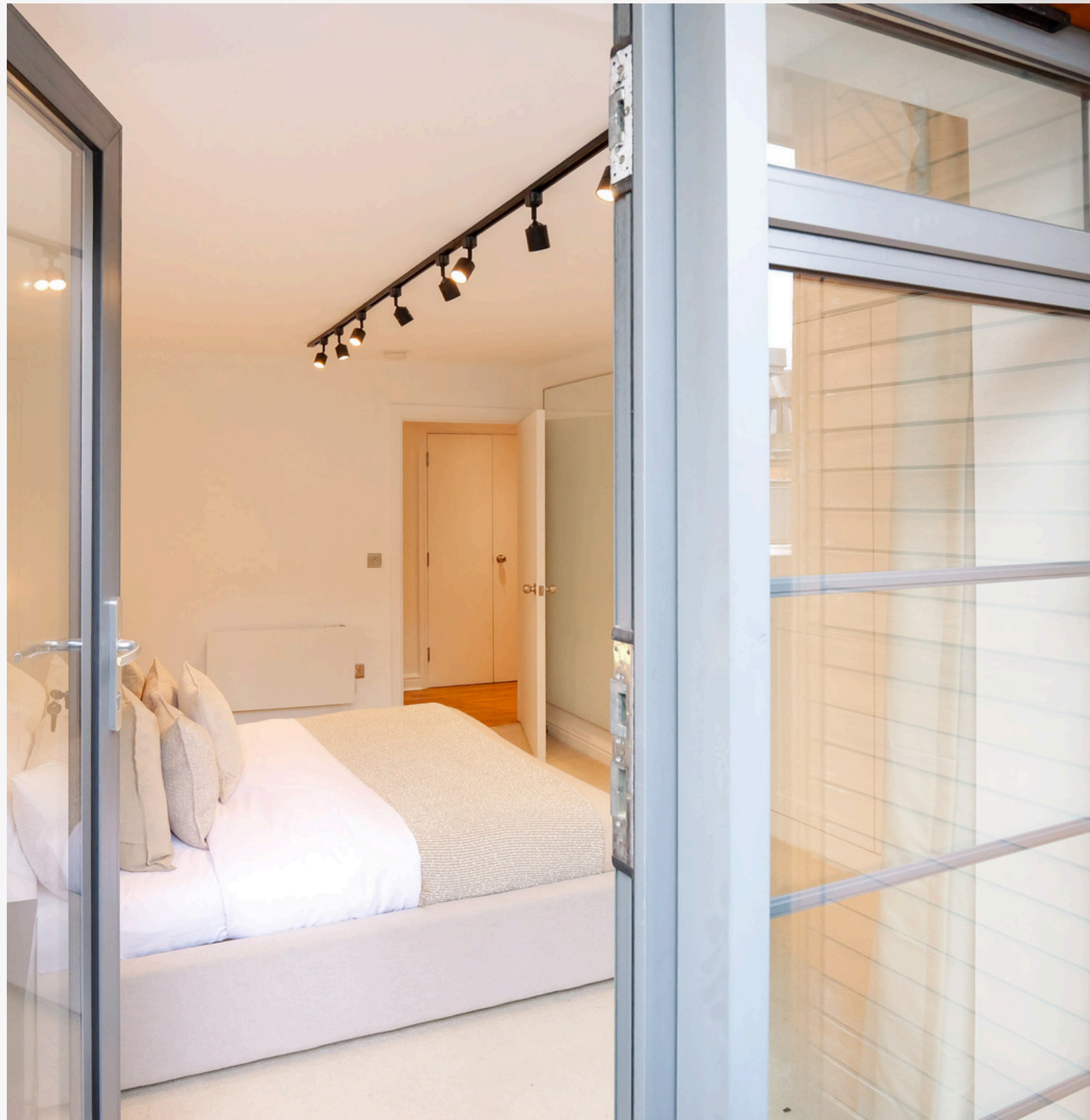
// AXIS, CASTLEFIELD