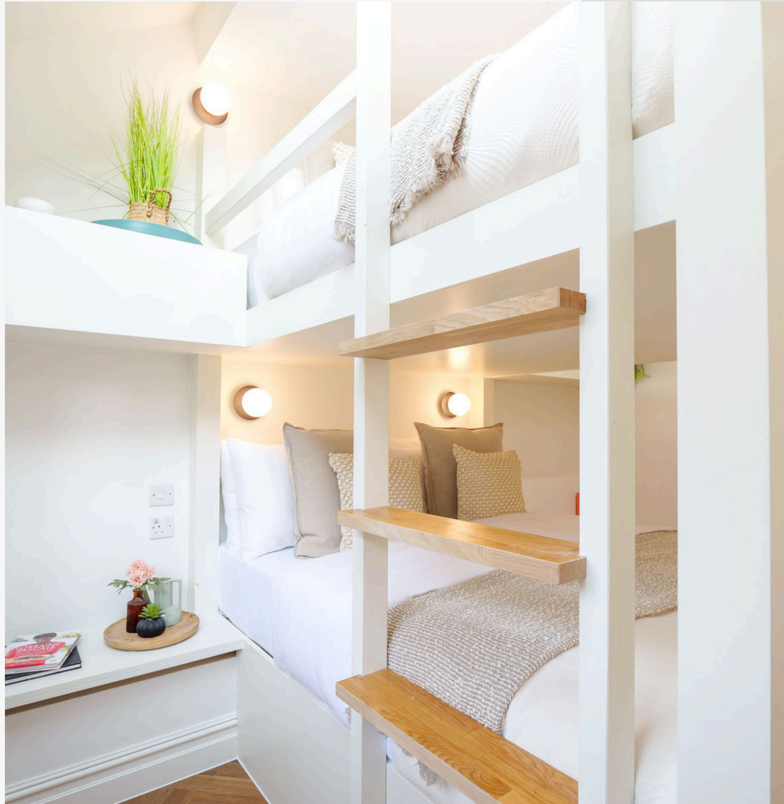
// SHUTTLE, NORTHERN QUARTER