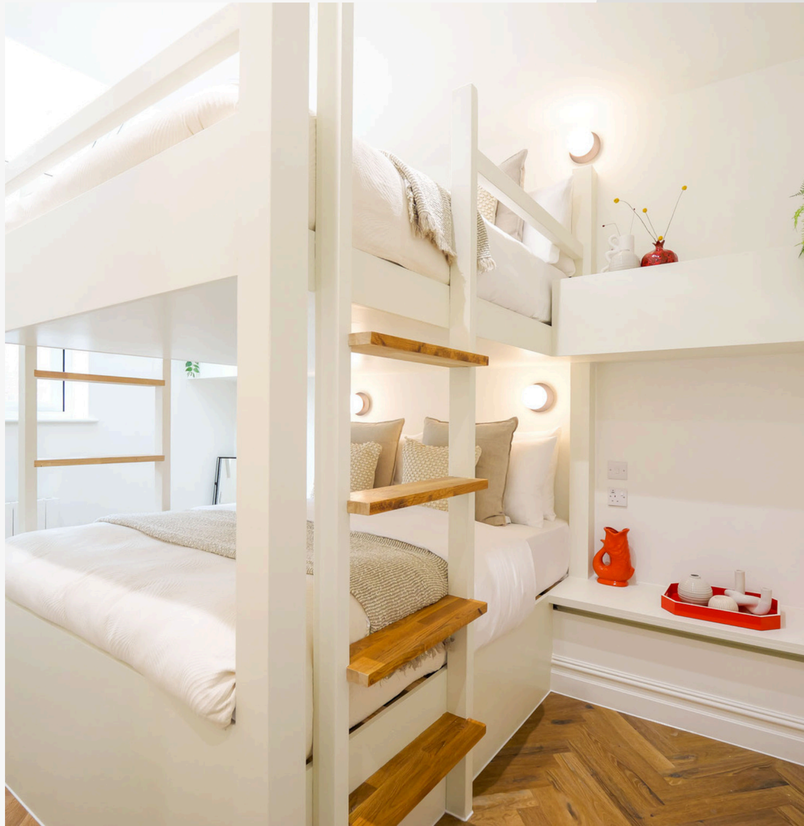
// SHUTTLE, NORTHERN QUARTER