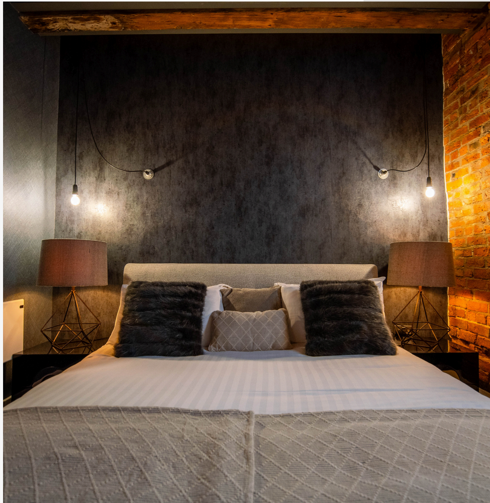
// MILANO, PICCADILLY