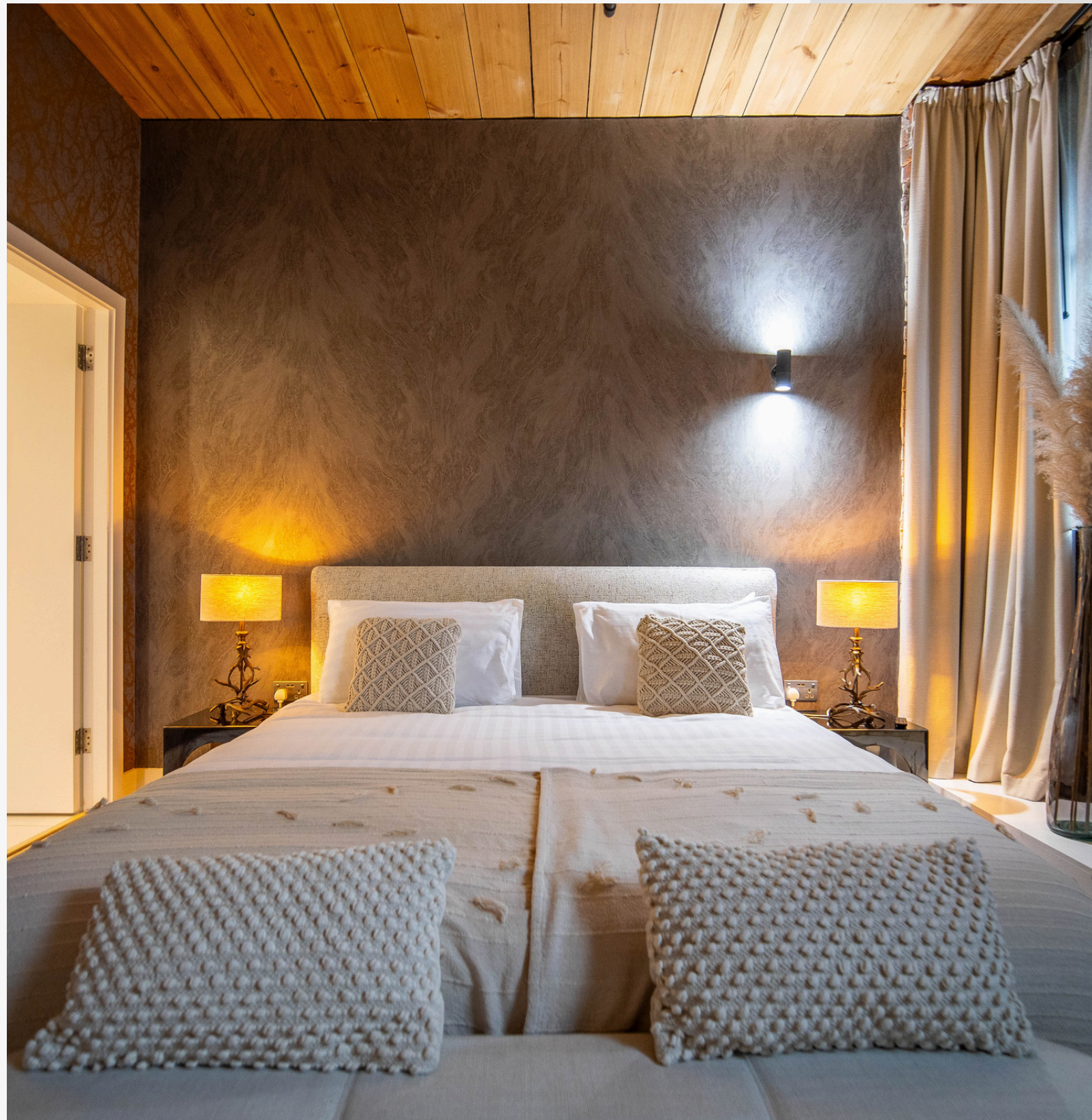
// MILANO, PICCADILLY