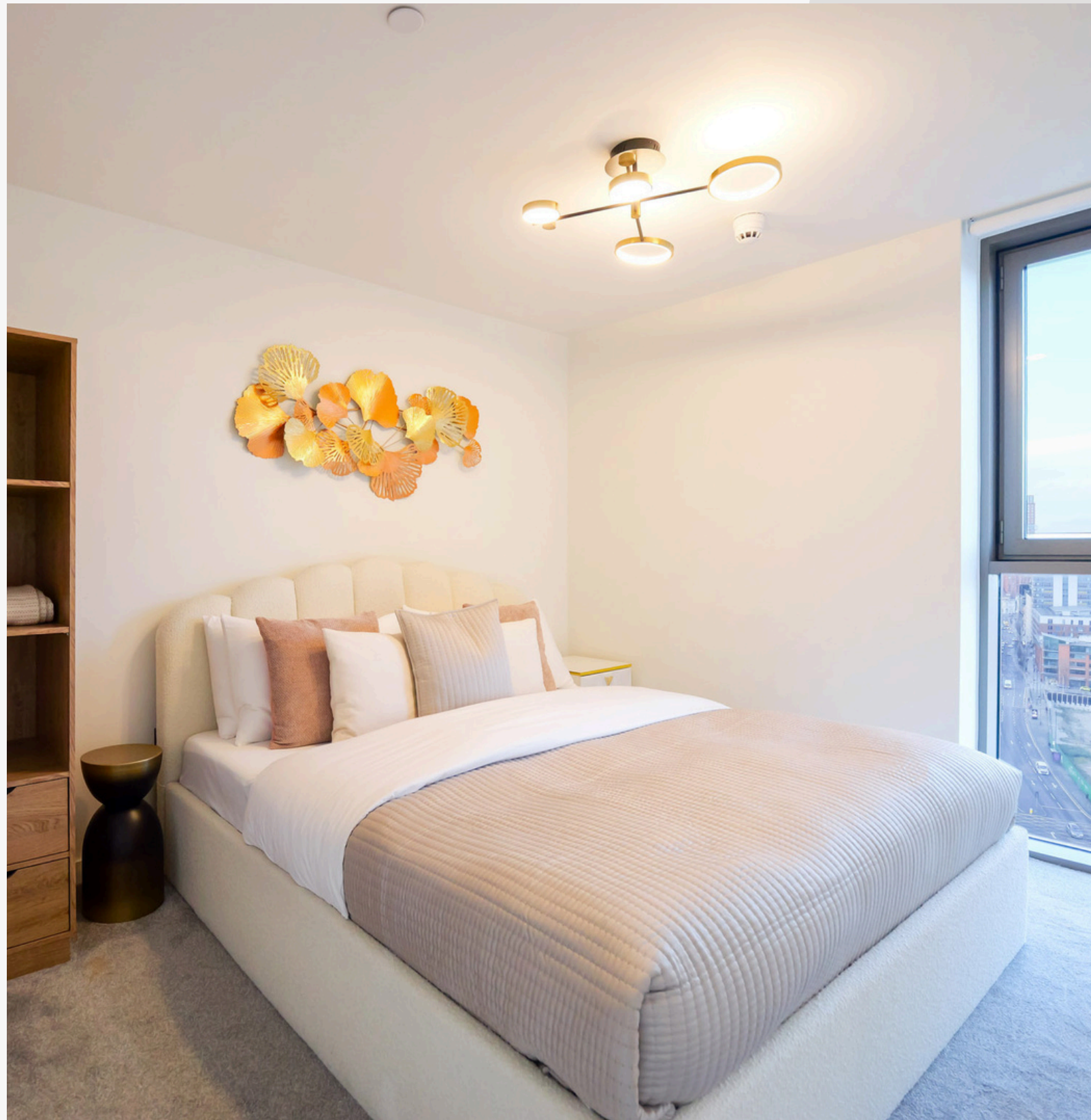
// ASPECT, PICCADILLY