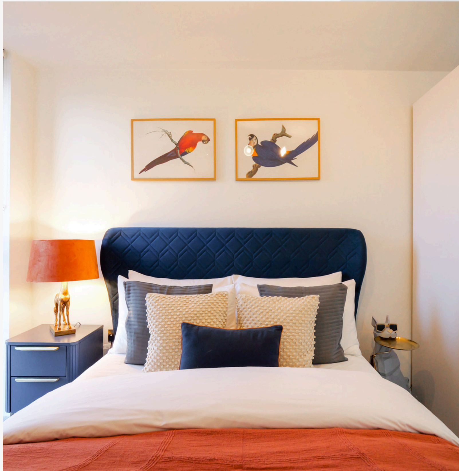
// ASPECT, PICCADILLY