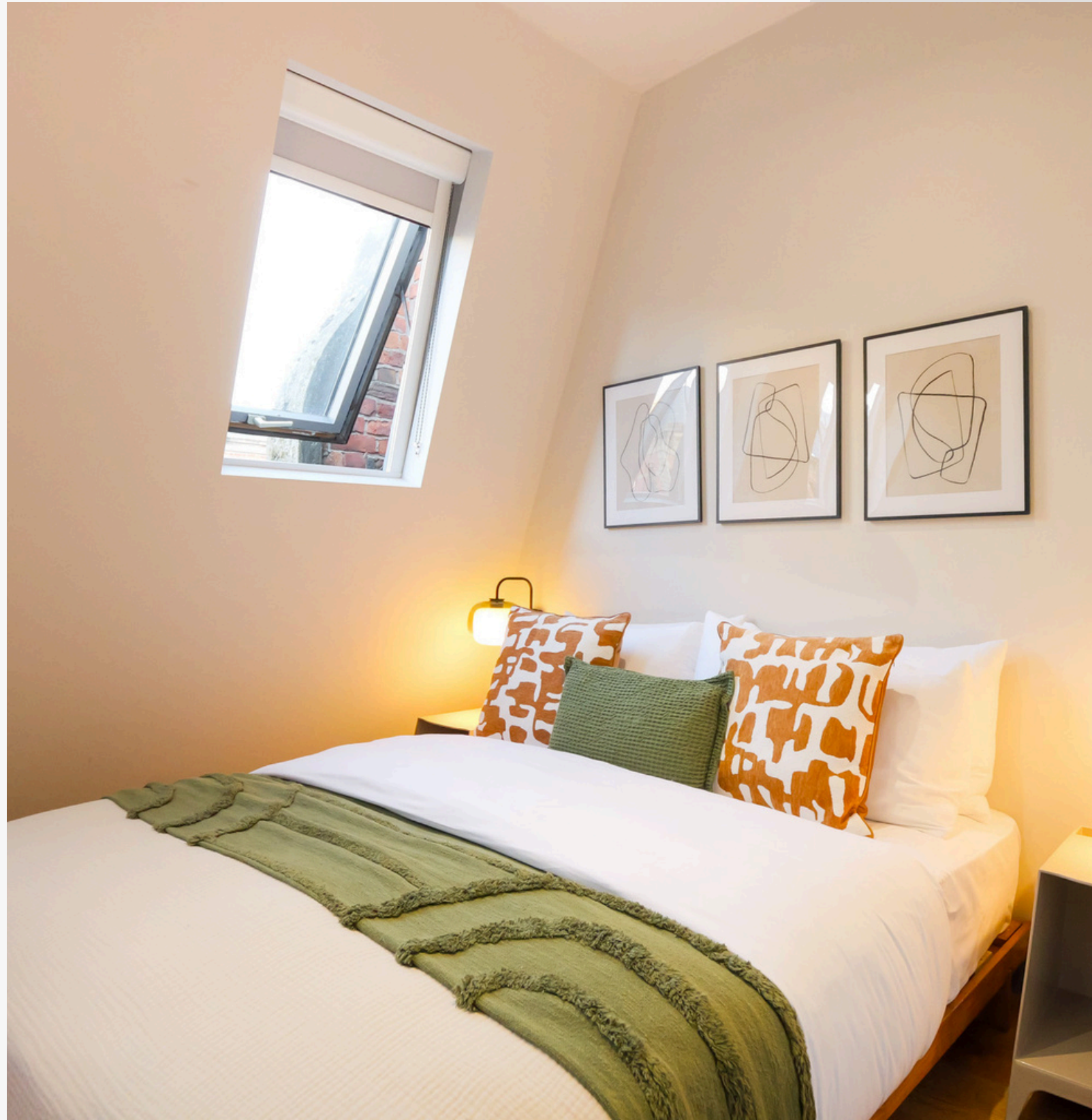
// GATSBY, GAY VILLAGE