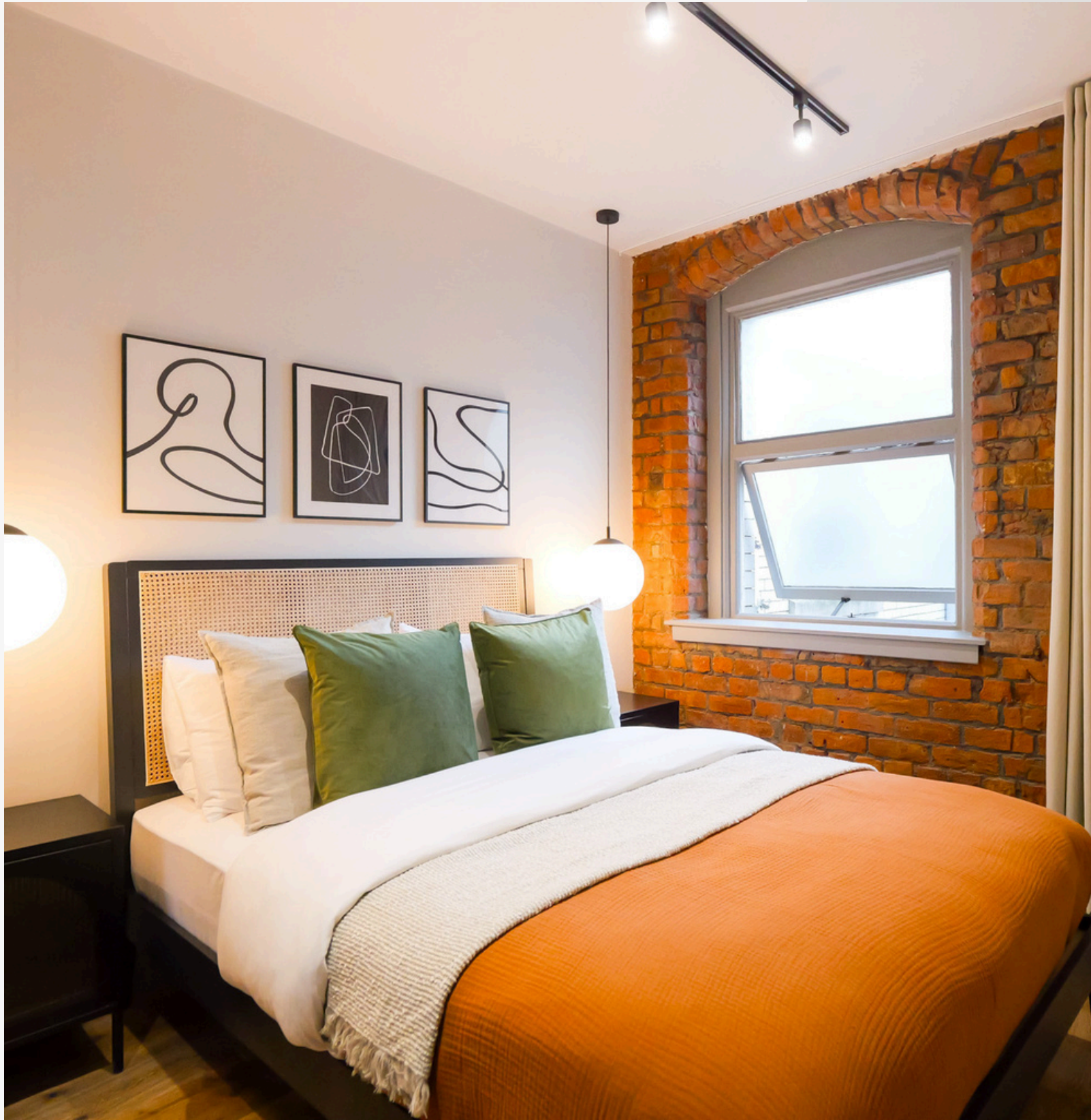
// GATSBY, GAY VILLAGE