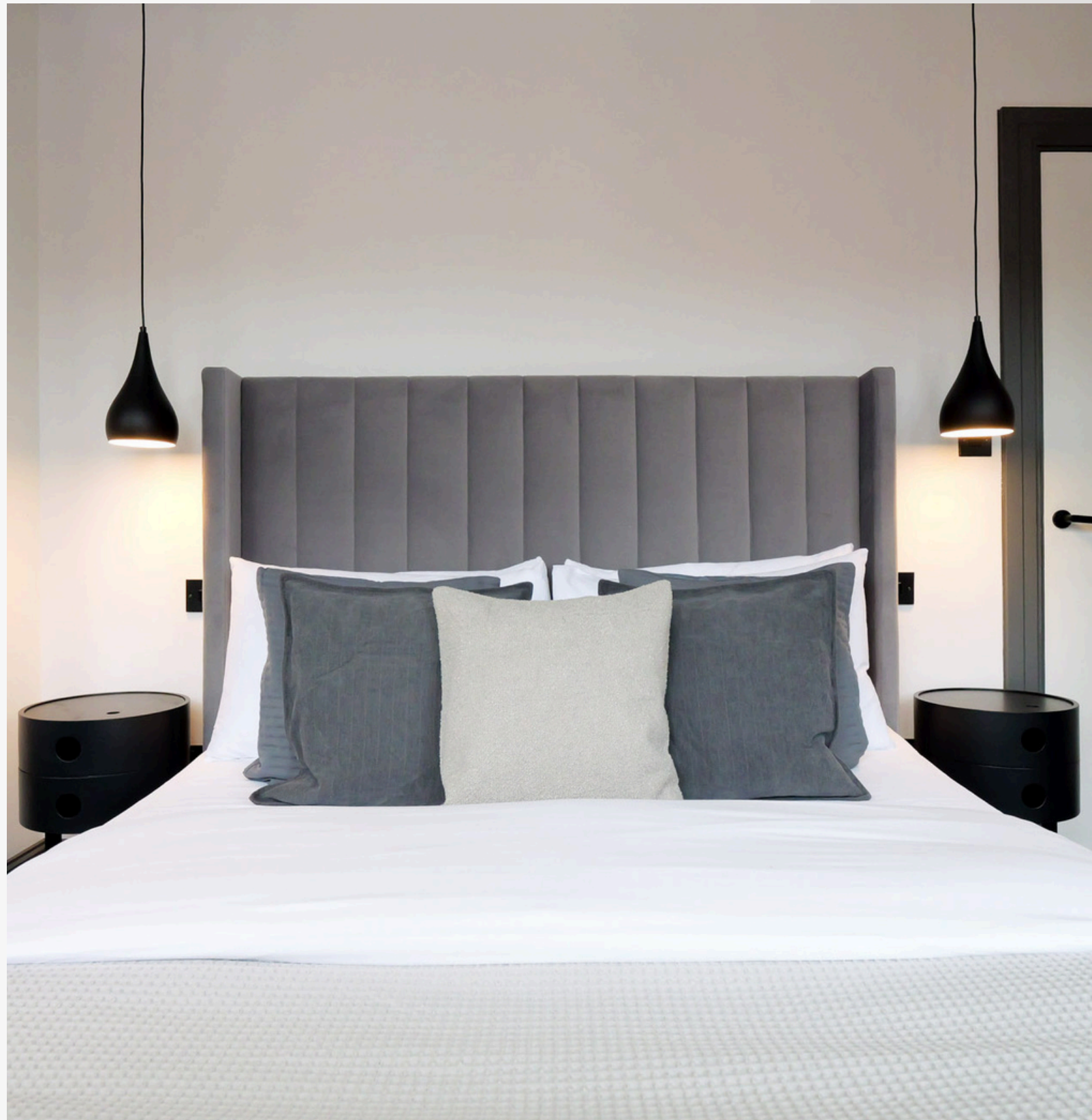
// CHROMO, NORTHERN QUARTER